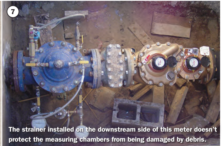
The strainer installed on the downstream side of this meter doesn't protect the measuring chambers from being damaged by debris.