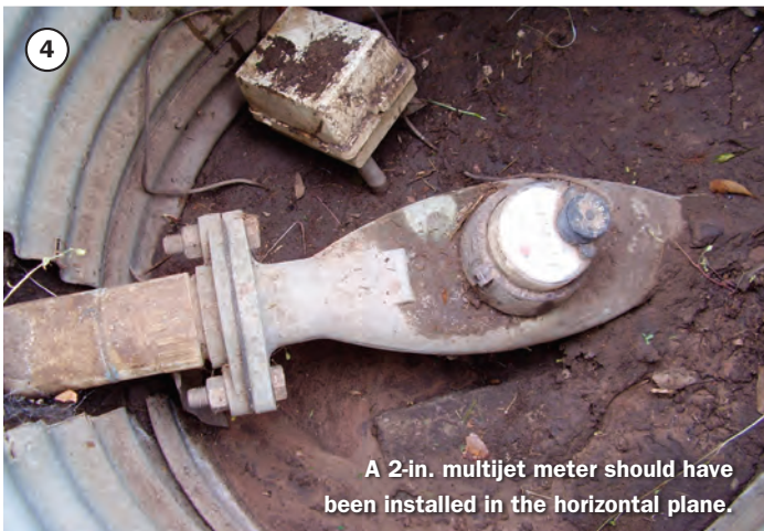
4 A 2-in. multijet meter should have been installed in the horizontal plane.

Independent research for singlejet meters shows that a new, horizontally installed meter may not achieve an error rate of less than 5 percent until it reaches a minimum flow rate of 0.14 gpm. If the same new singlejet meter is installed at a 45° angle, an error rate of less than 5 percent isn't realized until the flow rate reaches 0.19 gpm. If installed at a 90° angle, the error rate of less than 5 percent isn't realized until the flow rate reaches