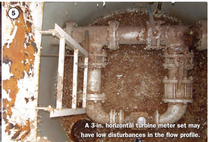
5 A 3-in. horizontal turbine meter set may have low disturbances in the flow profile.