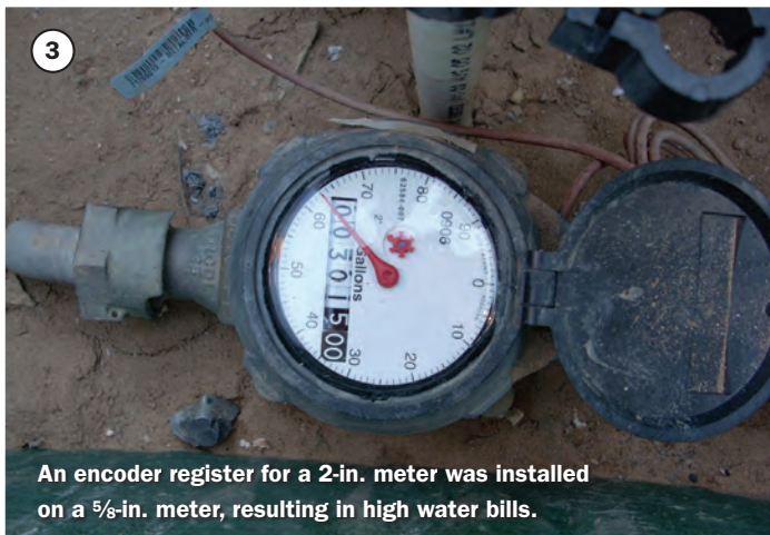
3 An encoder register for a 2-in. meter was installed on a 5/8-in. meter, resulting in high water bills.

completely replumbed, and a new 2-in. positive-displacement meter was installed in the horizontal plane.