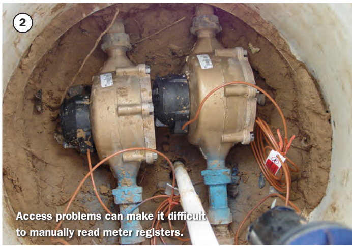
2 Access problems can make it difficult to manually read meter registers.